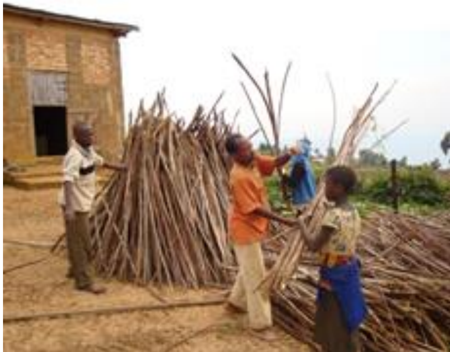
Figure 3: Illustration of piling upside down of stakes in preparation for storage after harvest

climbing bean production. Some of the measures implemented included staking immediately stakes are taken to the field to avoid theft. Some periodically monitor to ensure security of both beans and stakes or employ guards against thieves while the crop is still in the field. While others harvest and carry climbing beans up to home when still on the stakes which saves the stakes from both theft and wild fires.