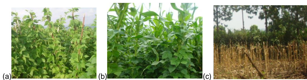
Figure 1: Staking climbing beans using (a) eucalyptus wood, (b) maize plants; (c) maize stovers ready to be used as stakes for climbing beans

Chi-square =109.77, df =5, p<0.001 ; Long term maturing trees ( Eucalyptus , Acacia mearnsii (black wattle); Shrubs ( venonia , dariya , Umukondogoro ); Agro forestry trees ( Calliandra calothyrsus , Sesbania sesban , Leucaena leucocephala , cypress ).